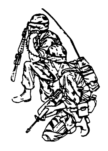
FIGURE 3-1. GOOD SUBJECT IDENTIFICATION.