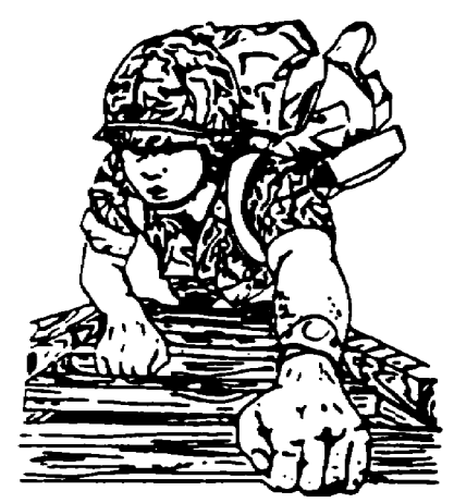
FIGURE 3-3. USE CREATIVE ANGLES.

You can creatively use a variety of angles during a personality shoot. Try different angles to capture the perspective and mood of the subject. If the subject is looking downward as he ties a slip-knot, kneel down and shoot up at the subject. Be careful not to distort the subject with un extreme angle; you can make his nose too long if you shoot looking down at him. Avoid extreme, "artsy" angles; they are considered amateurish and usually do not contribute to showing the subject's personality.