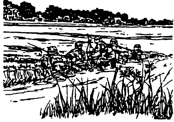
FIGURE 2-3. AN EXAMPLE OF CROPPING TIGHTLY AND LOOSELY. THE IMAGE ON THE LEFT IS CROPPED TOO TIGHTLY IN THE CAMERA. THE IMAGE ON THE RIGHT IS CROPPED LOOSELY IN THE CAMERA'S VIEWFINDER. THE PHOTOGRAPH CAN THEN BE CROPPED LATER IN THE DARKROOM.