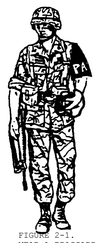
WEAR A BRASSARD

Get the rest of the five W's and H. or verify those you have. Be sure to get the correct name or nomenclature of vehicles, weapons or equipment appearing in the photo. Write the information in the caption log, making sure to identify the information needed for each frame.